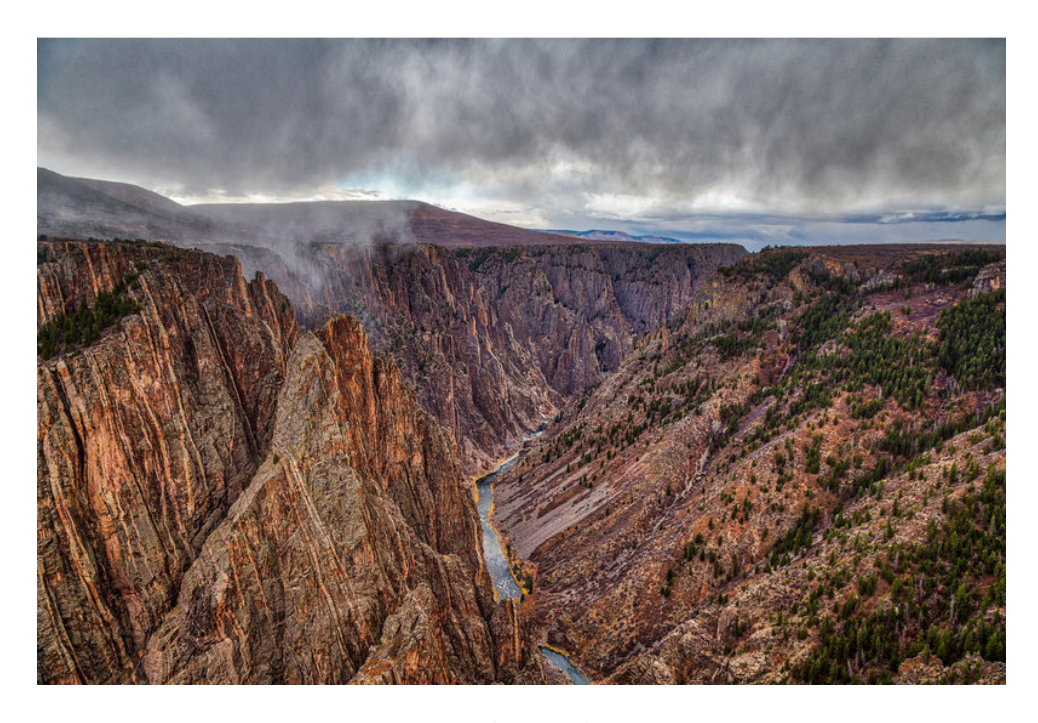
Local Attractions Black Canyon of the Gunnison National Park Montrose Water Sports Park Ridgway Reservoir Ouray Hot Springs