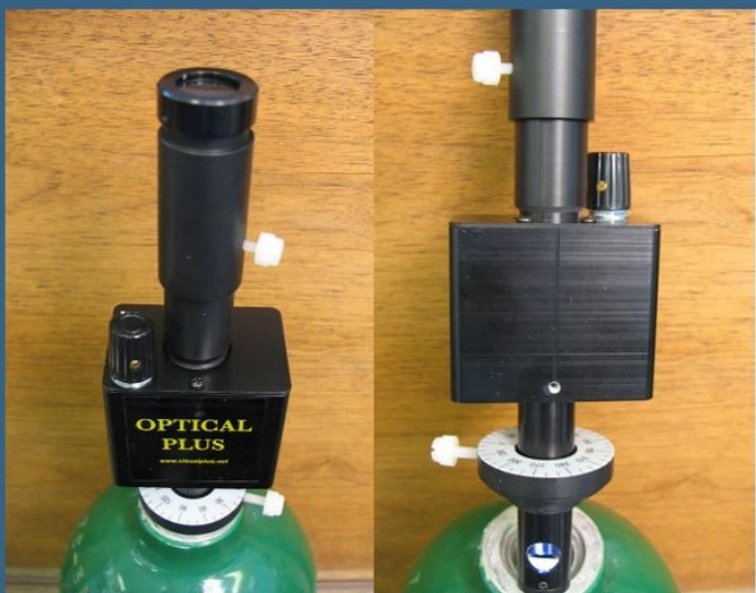
Optical Plus Galiso P/N 85-11-0077