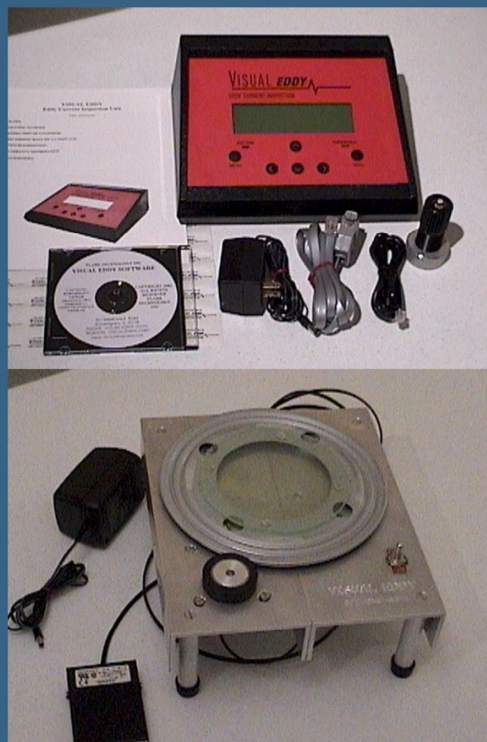
Eddy Current Integration Galiso Test Software Video **** See VIDEO Below ****